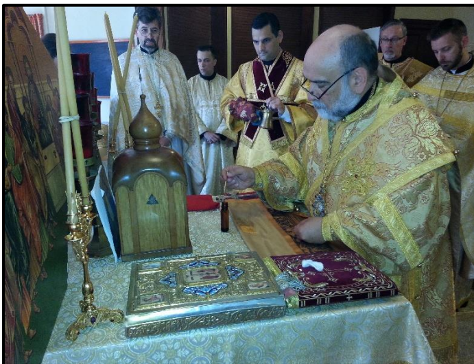
Blessing the Antimenses for St. Simon's