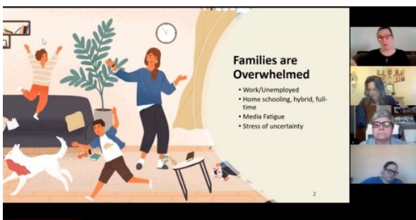
Back to Basics CS Workshop #3 10-2-21

Learning how to reunite with our youth and how to bring them back to church