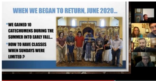
Success Stories - Christian Education During the Pandemic - 9/28/21

A sharing of successful Christian Education classes and activities during this past year