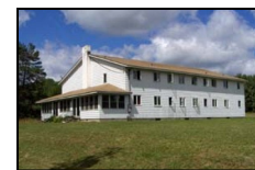
Sleeping Quarters & Meeting Hall

Contact: Daria York to make a booking at: 315-383-2686