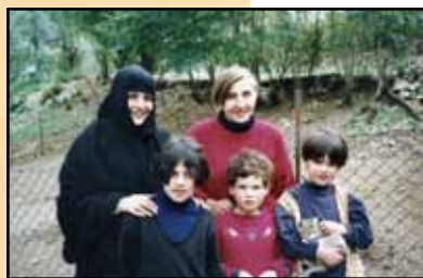
Mother Mariam with former street children in Bediani.

American Friends of Georgia, Inc. (AFG) is a non-profit, non-political, U.S. based public charity with 501(c)(3) tax-exempt status. AFG was formed in 1994 to help the people of Georgia during a difficult post-Soviet transitional period.