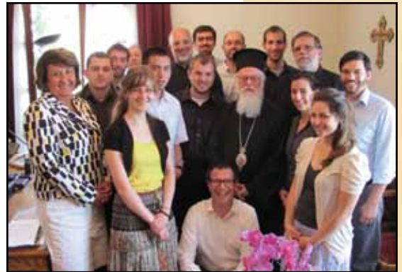
Seminarians with Archbishop Anastasios